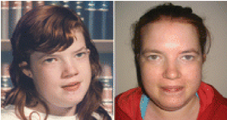
*Printed with permission

Kapadia et al, (2008) CMAJ ; 178 (4): 391-93